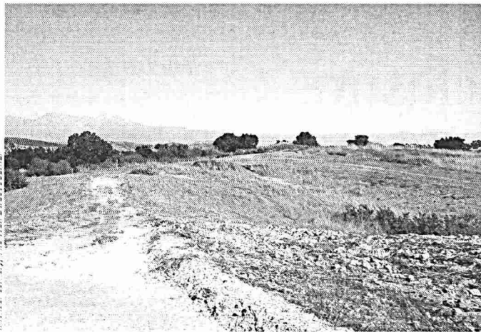
D.R. Horton recently sold this undeveloped parcel in Chino Hills, Calif. , a hard hit housing market east of Los Angeles.